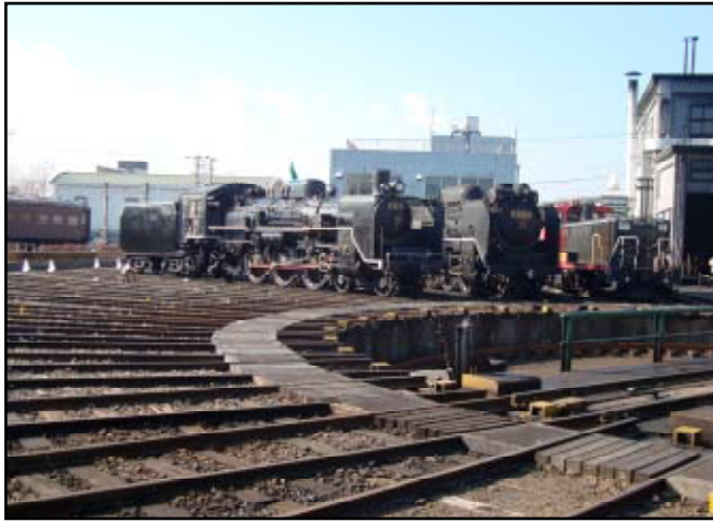
Serviceable locomotives prepared ready for action

non-running, but cosmetically well restored, locomotives on display.