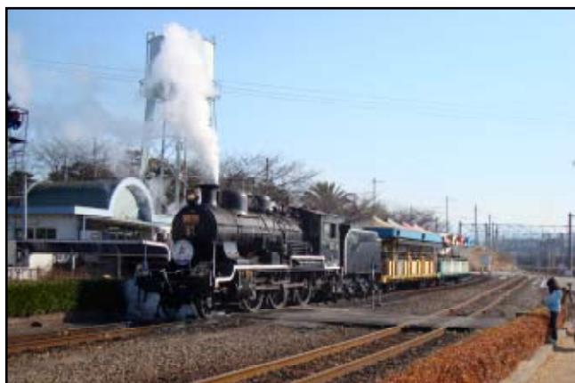
Locomotive 8530 in steam on the short demonstration line

Upon arrival in Kyoto I dumped my case in Left Luggage and jumped in a taxi with the intention of going to the steam museum. Unfortunately the driver spoke no English, so I rustled up a tatty copy of Steam Railway from my lap top case and showed him a picture of a 9F from the centre spread. Straight away his face lit up and he headed off in what was the correct direction.