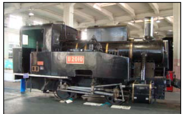
Small goods locomotive built in Britain and used for moving coal

The collection appeared to be carefully managed with a range of useable mainline traction from larger tank engines through to the express tender fleet, and a further good fleet of