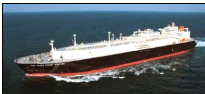
LNG Carrier the GDF Suez Point Fortin (Picture taken using a radio controlled Helicopter!) 289.93 metres long; 101129 Gross tonnes 151815 Cubic Metres Capacity Steam Turbine 29420 kW (38710 BHP)

The array of locomotives was amazing, and on the day of my visit there were six stabled that do regular service on the main line. A single diesel was on hand to drag various locos