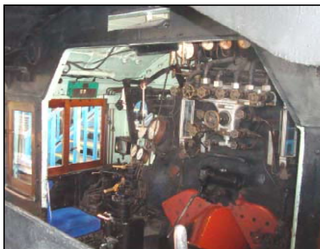
On one of the express locomotive footplates

Entrance fees were paid and entrance into the station building revealed a few model exhibits, a shop and a peculiar firing practice machine for training new crews of the steam age. It had a kind of conveyor belt, moving footplate and various obstacles with a variable grate area.