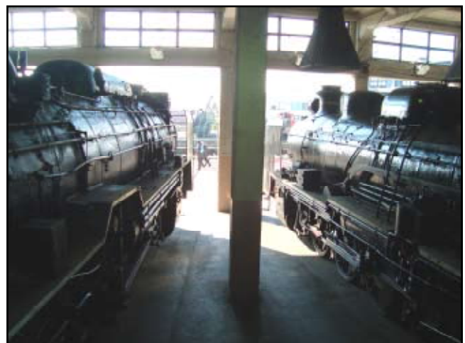
Two of the larger passenger express locomotives, both non-runners

The Museum has its own website that's well worth a visit http://www.mtm.or.jp/eng/umekoji/index.html