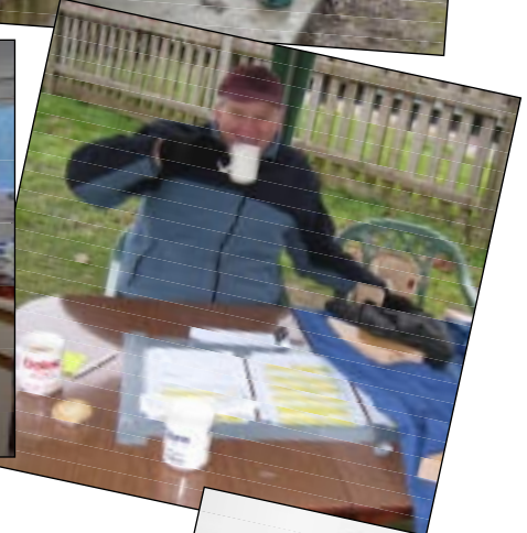
Santa Special 2008