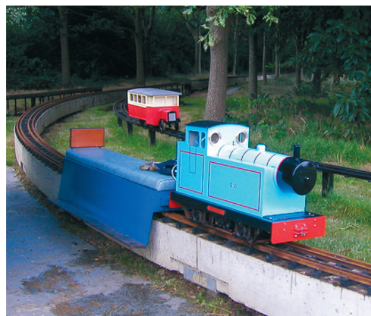
Sheddon Wheels poses for the camera whilst on passenger hauling duty at the Littledown Miniature Railway.

Built without the aid of any form of drawing, Ted's latest creation looks very resplendent in a fully lined out pale blue livery, complete with Driver George Wheatley and Fireman Mike Mortimer on the footplate and should prove popular with the children at Littledown.